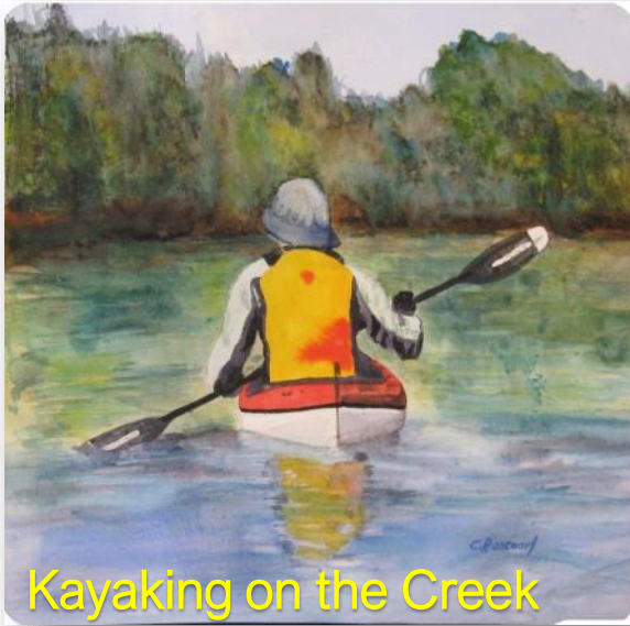
Kayaking on the Creek