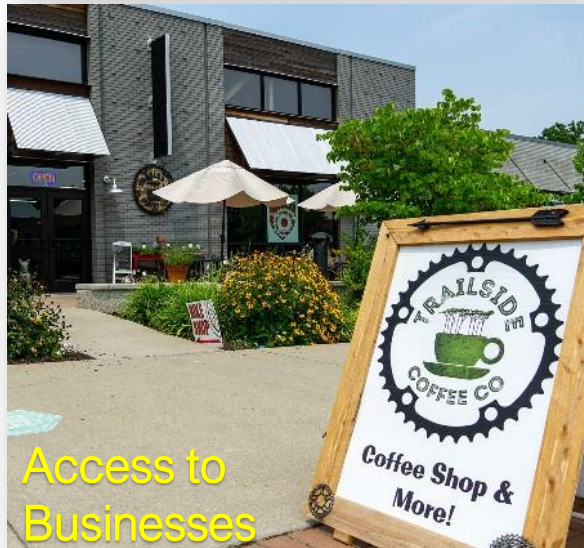
Access to Businesses