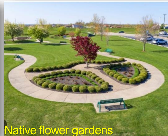
Native flower gardens