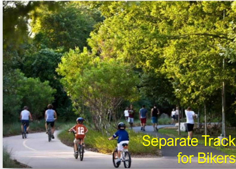
Separate Track for Bikers